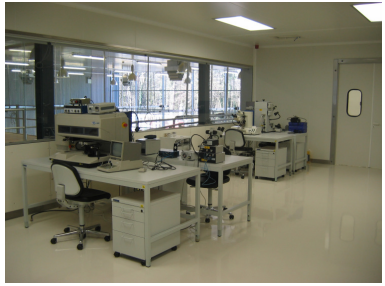
Figure 1 : Clean rooms

All the equipments available are manual and versatile to allow the largest and innovative capabilities for packaging application.