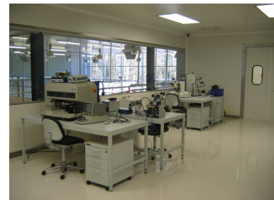
Figure 1 : Clean rooms

All the equipments available are manual and versatile to allow the largest and innovative capabilities for packaging application.