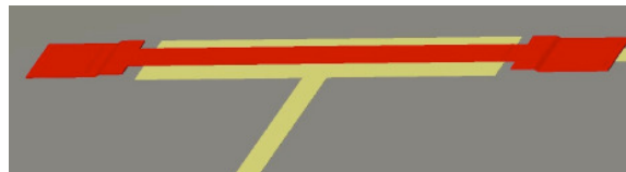
Figure 4: Simulation of a MEMS beam

External vibrations will have an effect on the dynamic of structure. Indeed, when electrostatic forces are used to actuate the device, due to this dynamic perturbation, the device may reach earlier the unstable zone and collapse to the ground which may cause damages. To avoid or predict this behaviour, simulations and experimental test has to be done.